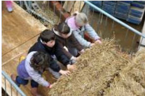
Construction of Victory Community Hall, Norfolk